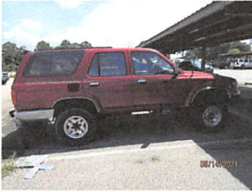
1900 Joe White Ave