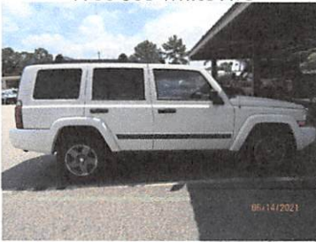
1900 Joe White Ave