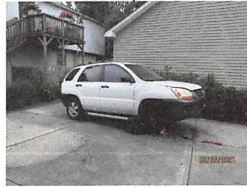
605 Maple St.