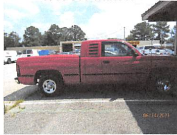
1900 Joe White Ave