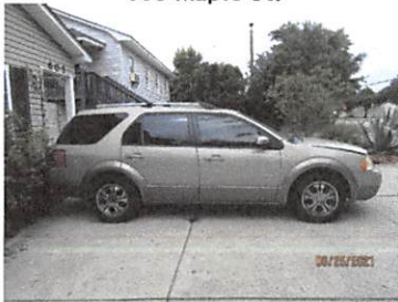
605 Maple St.