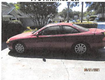
978 Antillies Ct.