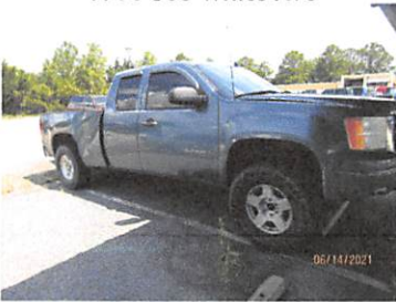
1900 Joe White Ave