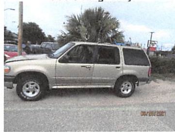
700 S Kings Hwy