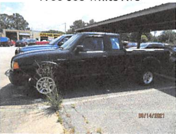
1900 Joe White Ave