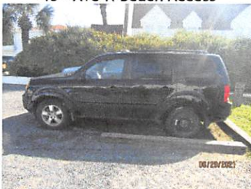
45 th Ave N Beach Access