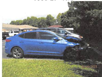
1000 29 th Ave