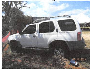
601 Flag St