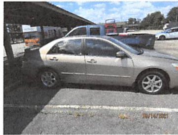
1900 Joe White Ave