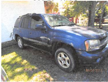
306 20 th Ave S