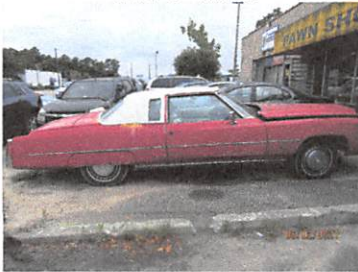
1118 3 rd Ave S