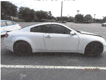
1241 38 th Ave