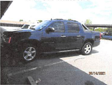
1900 Joe White Ave