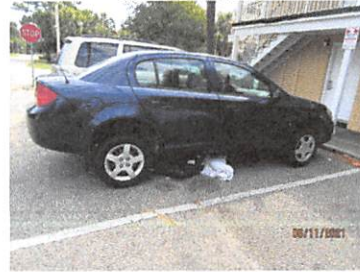
309 12 th Ave S