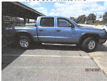
1900 Joe White Ave