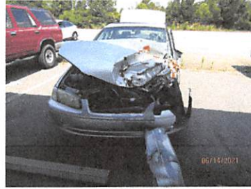
1900 Joe White Ave