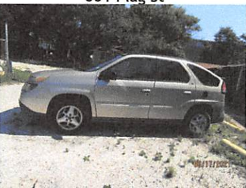
601 Flag St